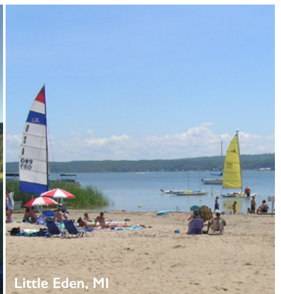
Little Eden, MI