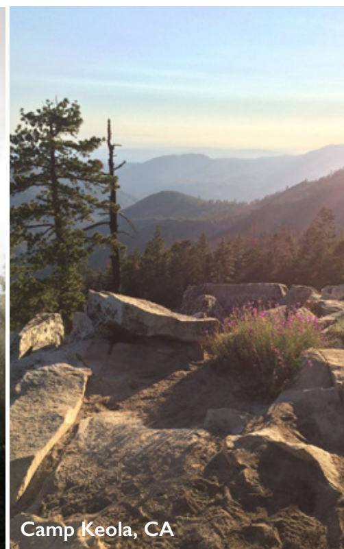
Camp Keola, CA