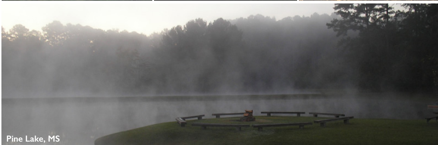
Pine Lake, MS