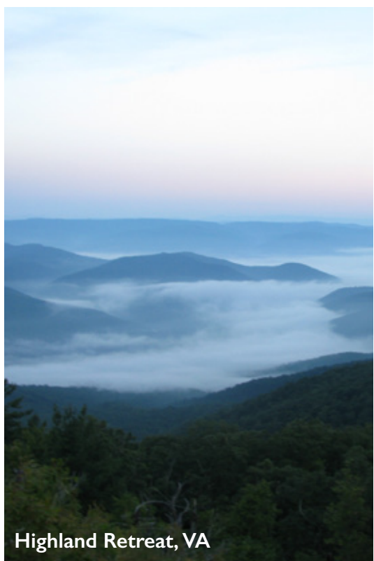
Highland Retreat, VA